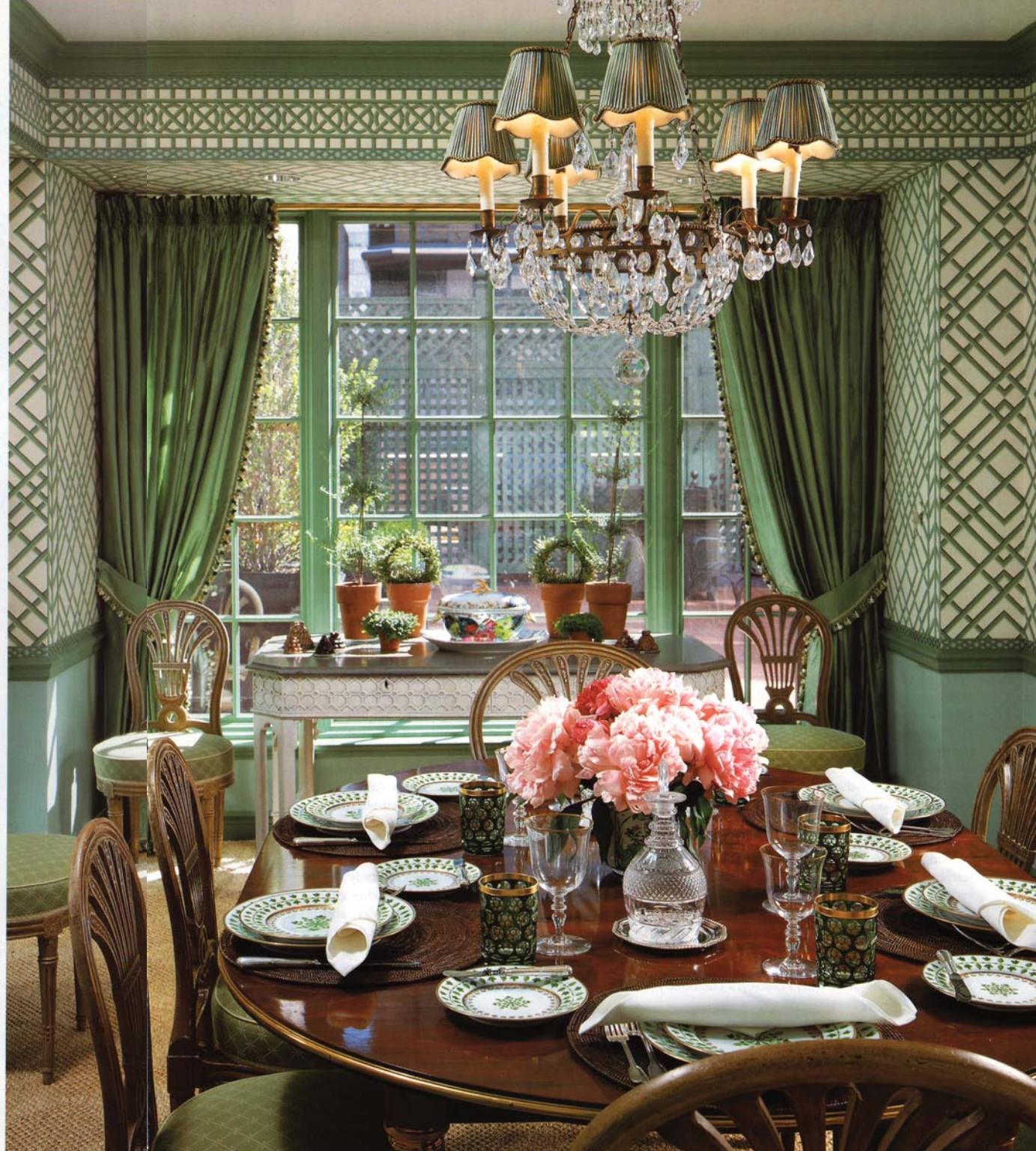
PRECEDING PAGES AND OPPOSITE: The living and dining rooms have a relaxed, almost country-house attitude. Mirrored screens enhance spaciousness and echo treillage. Wallpaper and fabrics for sofa, chairs and drapery from Brunschwig & Fils. Custom silver leafed, glass-topped coffee table and round side table by John Boone. Topiaries and sisal on the floor lighten the mood. Louis XVI dining table of mahogany with gilt mounts is surrounded by Louis XVI-style chairs with cushions covered in Clarence House fabric. Bernardaud china accompanied by English crystal. ABOVE: Library's mahogany and rosewood Regency desk looks onto the large and lushly planted terrace. Walls, curtains and ottoman in Clarence House cotton stripe. Paying homage to a Billy Baldwin classic, étagères were designed by James Petersen and made by John Boone.